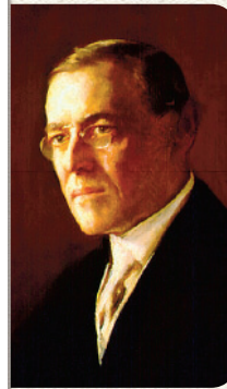
Woodrow Wilson 1856–1924

Wilson was tall and thin and often in poor health. He suffered from terrible indigestion and sometimes had to use a stomach pump on himself. A scholarly man, Wilson once served as president of Princeton University in New Jersey.